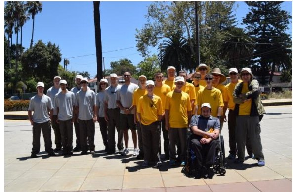
Troop 1 & Contingent Crew