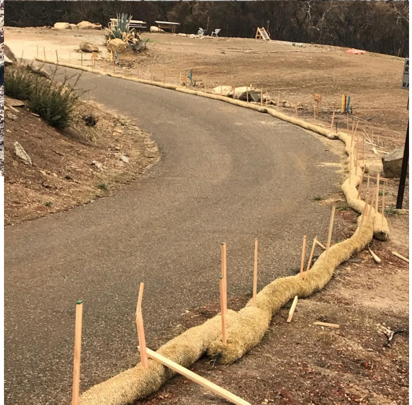
Ready to rebuild!