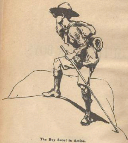
The Boy Scout in Action.